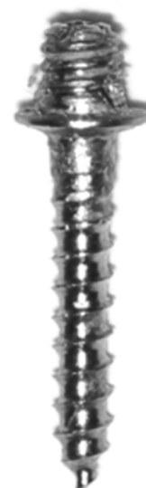
Figure 1 Screw-shaped titanium orthodontic miniscrews with a length of 8 mm and a diameter of 1.4 mm (Dual Tops; Jeil Medical Corporation).

A total of fifteen, 8-month-old New Zealand white adult male rabbits weighing 3000–3500 g were used for the study.